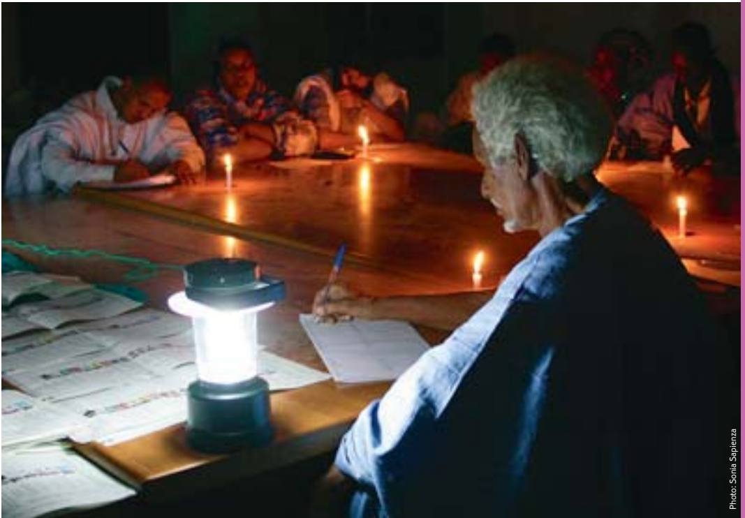
Recording results, Mauritania, 2007.

The results from the counting of votes will be recorded in official results protocols, which will require all significant data, such as the number of people who voted, the total number of ballots cast, the number of votes for each candidate and the number of invalid votes. The protocol may also be used to identify discrepancies