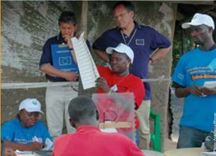
Counting the votes, Guinea Bissau, 2005.

Closing and counting procedures should be established in law and provide safeguards that guarantee a transparent, prompt and accurate count. Only authorised staff should be involved in the closing of polling and the counting of votes. All staff should follow procedures specified in the law and regulations. Counting of-