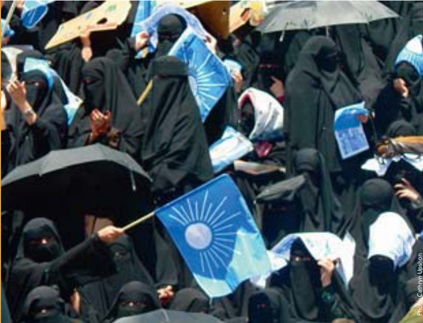
Political rally in Yemen, 2006.