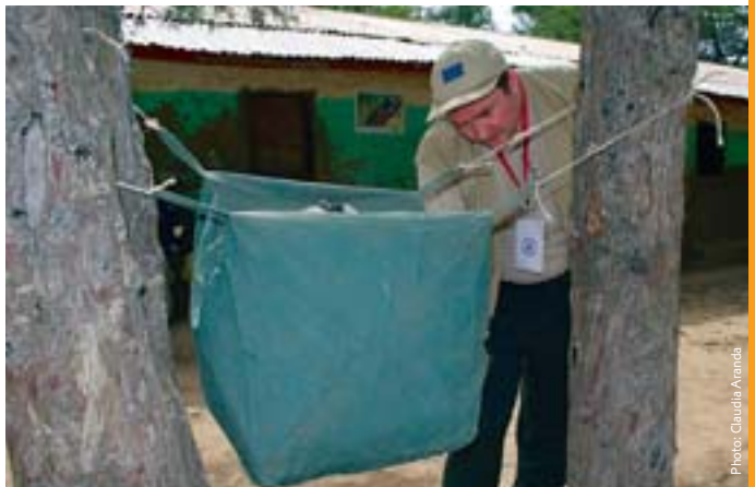
An EU observer examines a ballot box, Ethiopia, 2005.

All voters have the right to vote in secret. It is the responsibility of the authorities to guarantee this right through provision of polling booths that allow ballot papers to be marked in private. Marked ballots should not be inspected before being placed into a ballot box, or contain any identifying features that would enable the ballot paper to be traced back to the voter who marked it. Voters should not be intimidated or coerced into revealing for whom they voted. Except in cases where a voter is being lawfully assisted, a voter cannot waive their right to vote in secret. Voting at the same time as another person in the same polling booth (so-called family/group voting ) and voting outside a polling booth ( open voting ) should be prohibited.