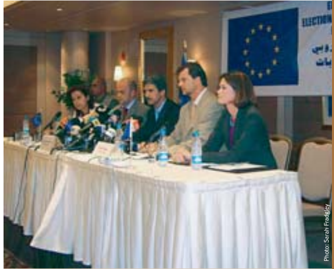
Launching the EU EOM in Lebanon, 2005.

The CO and the DCO return to the country to deliver the final report. In the course of this visit, they will present the report to the state and electoral authorities, political parties and CSOs. At these meetings, the CO should be prepared to explain the basis of the assessment contained in the report and, in particular, to discuss practical steps for the implementation of the recommendations. After sharing the final report with key interlocutors, the chief observer should hold a press conference to officially release the final report to the media and the wider public. A press release may also be issued to accompany the final report that includes quotes by the CO.