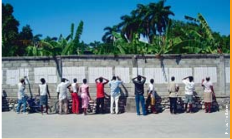
Checking the voter register, Haiti, 2006.

A voter register has to be regularly updated to remain accurate. This can take place on an ongoing basis, at fixed regular periods, or only when an election is called. Whichever method is chosen, it should ensure that all electors who are eligible to vote on the date of the election are included in the voter register. In cases of active registration, the responsible bodies should conduct voter education to ensure the fullest participation in the registration process. In cases of passive registration, eligible electors should be provided with the opportunity to inspect the voter register to confirm their inclusion.