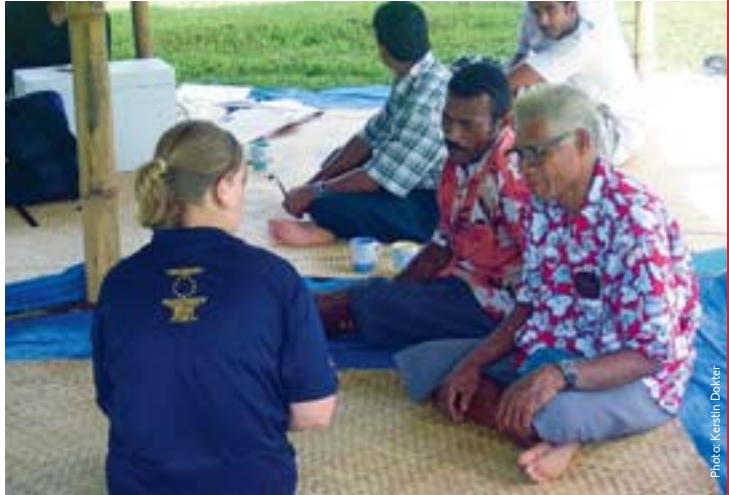
LTOs meeting election stakeholders, Fiji, 2006.

The criteria for the field deployment of LTO teams is outlined above in Section 5.2.6 Criteria for Deployment of Observers . Ideally, all regions of the host country will be covered by LTO teams, unless logistical or security reasons restrict deploy-