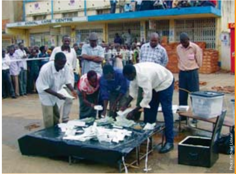
Observing counting at a polling station, Uganda, 2006.

Candidates and political parties have the right to challenge the validity of election results. Procedures should be established to allow challenges to be made within an appropriate timeframe to an independent body, such as a court. Challenges should be dealt with impartially, and decisions should be based on the available evidence and made without political consideration. Where results have been successfully challenged, for example because of proven violations of voting procedures, voting should be