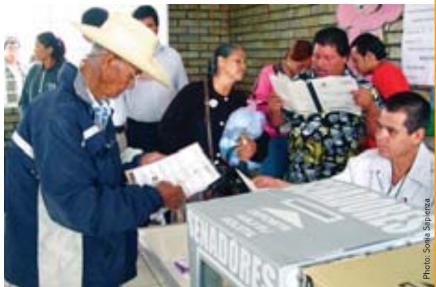
Voter receiving a ballot paper, Mexico, 2006.

Civil society organisations will often participate in an electoral process through domestic non-partisan election observation. Such work greatly enhances the transparency of the electoral process and can make a vital contribution to public confidence in the credibility and legitimacy of an election. A legal framework for elections should provide guarantees for the right of domestic non-partisan observer groups, in addition to similar rights provided to candidates, political parties and their agents, to observe all aspects of the electoral process. It is important that non-partisan domestic observer groups enjoy the respect and the confidence of the public. Such groups should play a clearly neutral role