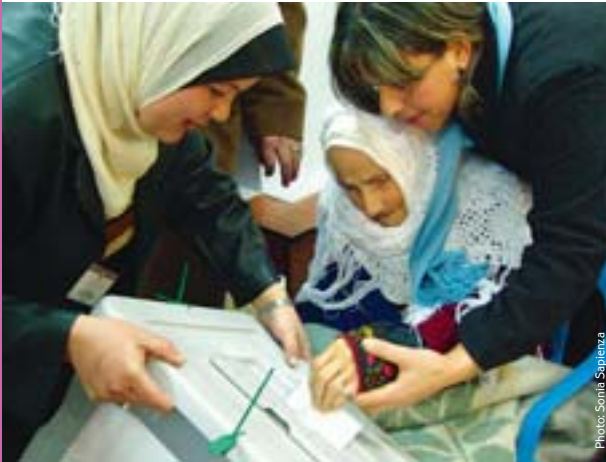
Assisted voting, West Bank and Gaza, 2006.