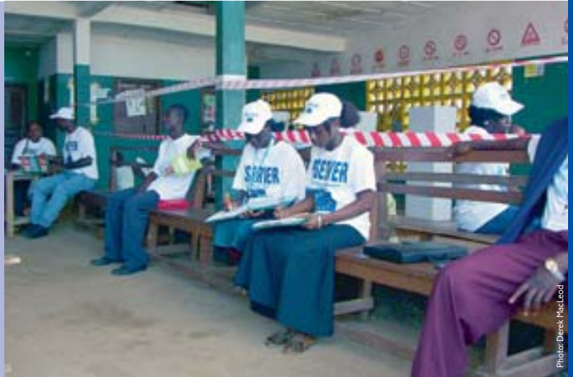
Domestic observers, Liberia, 2005.

conduct of the election process, but draw their own assessments and conclusions, independently of domestic groups.