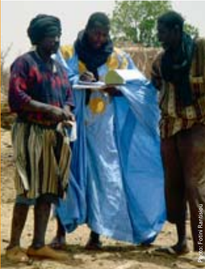
Recording complaints, Mauritania, 2007.

The procedures for addressing complaints and appeals vary among countries but will be expected to provide for a hierarchical right of appeal. Electoral disputes may be initially handled by the election administration and appeals lodged before a court. Alternatively, complaints may be dealt with by the election administration only, or by the judiciary only. Some countries enable final appeals to be lodged with parliament, which creates a possibility for a conflict of political interest. Confidence in a complaints resolution process is greatly enhanced where there is right of appeal to a court, as election administrators may have a conflict of interest in adjudicating an election dispute. The adjudication process can be undermined where there is a lack of public confidence in the independence and impartiality of the judiciary. The complaints procedure should be undertaken in a transparent manner, including public hearings and the publication of decisions and reasons. All final decisions are expected to be enforced.