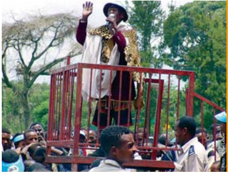
Rural campaigning in Ethiopia, 2005.

Responsible authorities should implement and enforce campaign regulations in a consistent and impartial manner. Any restrictions on campaigning, such as a requirement for advance permission for holding a public rally, will need to be applied equally to all contestants and should not be implemented in a way that limits legitimate opportunities to campaign. Where a 'campaign silence' is imposed in the period immediately before election day, it should be effectively and consistently enforced. All contestants have a duty to campaign fairly and make efforts to prevent violations of the election legislation and regulations. Promotion of self-regulation by candidates and political parties can provide a useful contribution to a fair campaign, for example, through the establishment of a code of conduct.