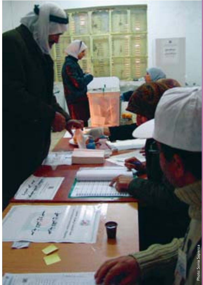
Voting in West Bank and Gaza, 2006.

Observers should position themselves for a good view of voting procedures and should also move around the polling station to gain different perspectives. Whenever possible, observers should speak with a number of different polling station officials, particularly when the polling committee includes representatives of different political parties. EU observers should also try to speak with others who may be present, including candidate agents, political party representatives, and non-partisan observers. These people, who are often in the same polling station all day, may provide helpful information on the environment at the polling station and whether problems have occurred.