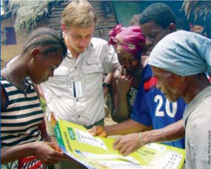
Voter education, Liberia, 2005.