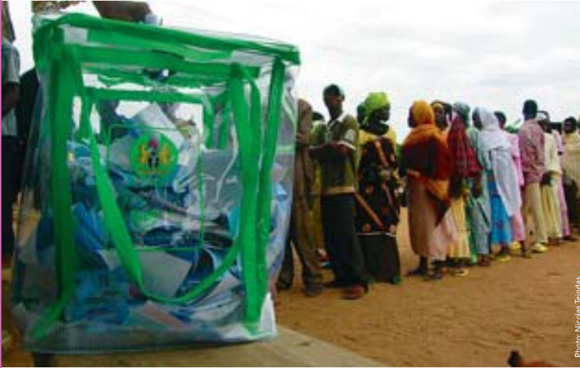
Waiting to vote, Nigeria, 2007.