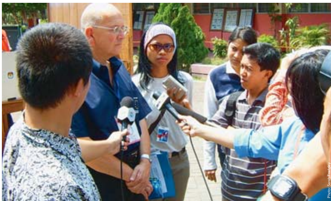
Meeting the media, Indonesia, 2004.