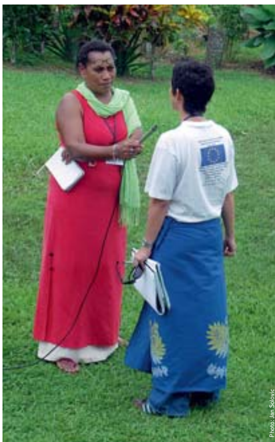
Speaking to the media, Fiji, 2006.

A key event for the EU EOM is the release of its preliminary statement shortly after election day (see Section 8.3 Preliminary Statement ). In deciding when to release this statement, the EU EOM should balance the expectation and interest in a prompt assessment with the need for time to produce an accurate and comprehensive analysis