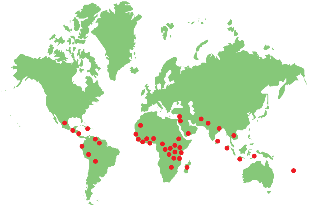
World map showing places of deployment for EU EOMs between 2000 and 2007. In this period 64 EOMs were deployed.