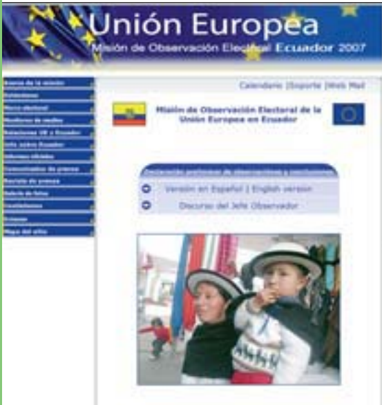
Website of the EU EOM to Ecuador, 2007