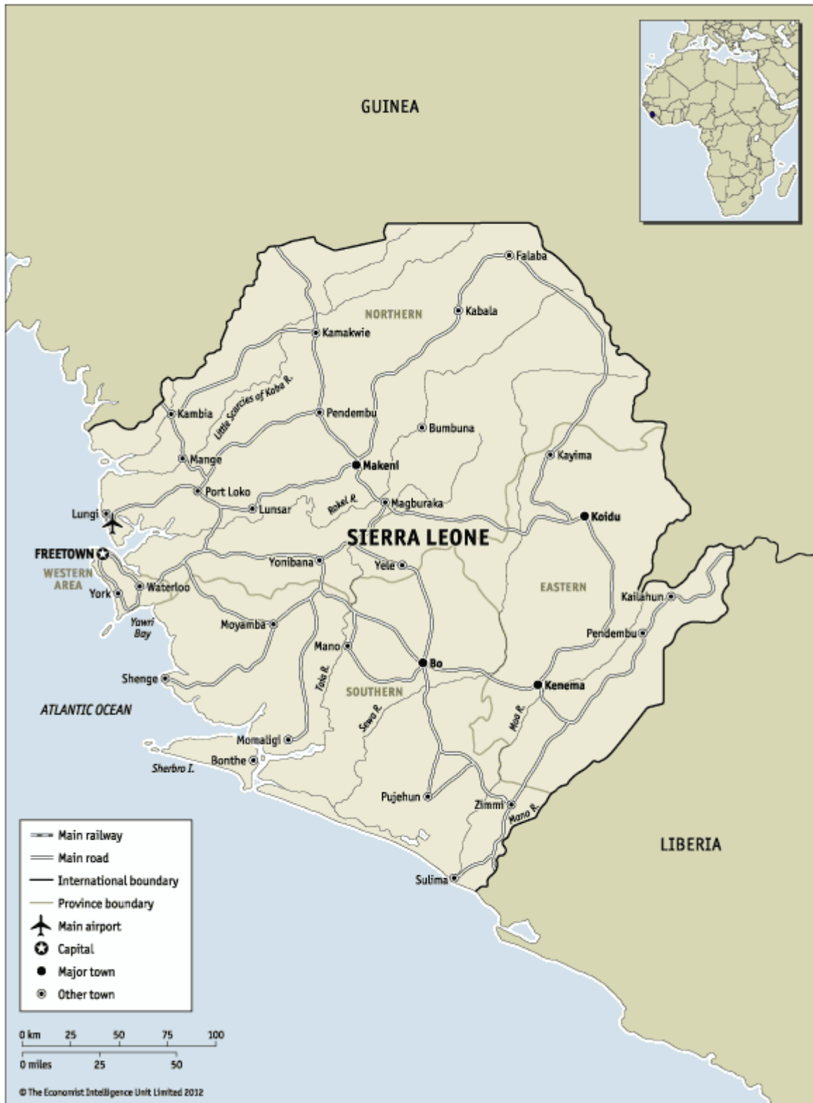
Source: Economist Intelligence Unit