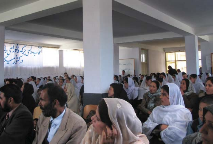
On the 1st of May , a women's project was implemented by the Health Development Center for Afghan Women in Bagh-e-Zanana (the Women's Park). An estimated 200 women gathered for this event. The Students of Girls School conducted a theatrical performance covering elections topics for this event.