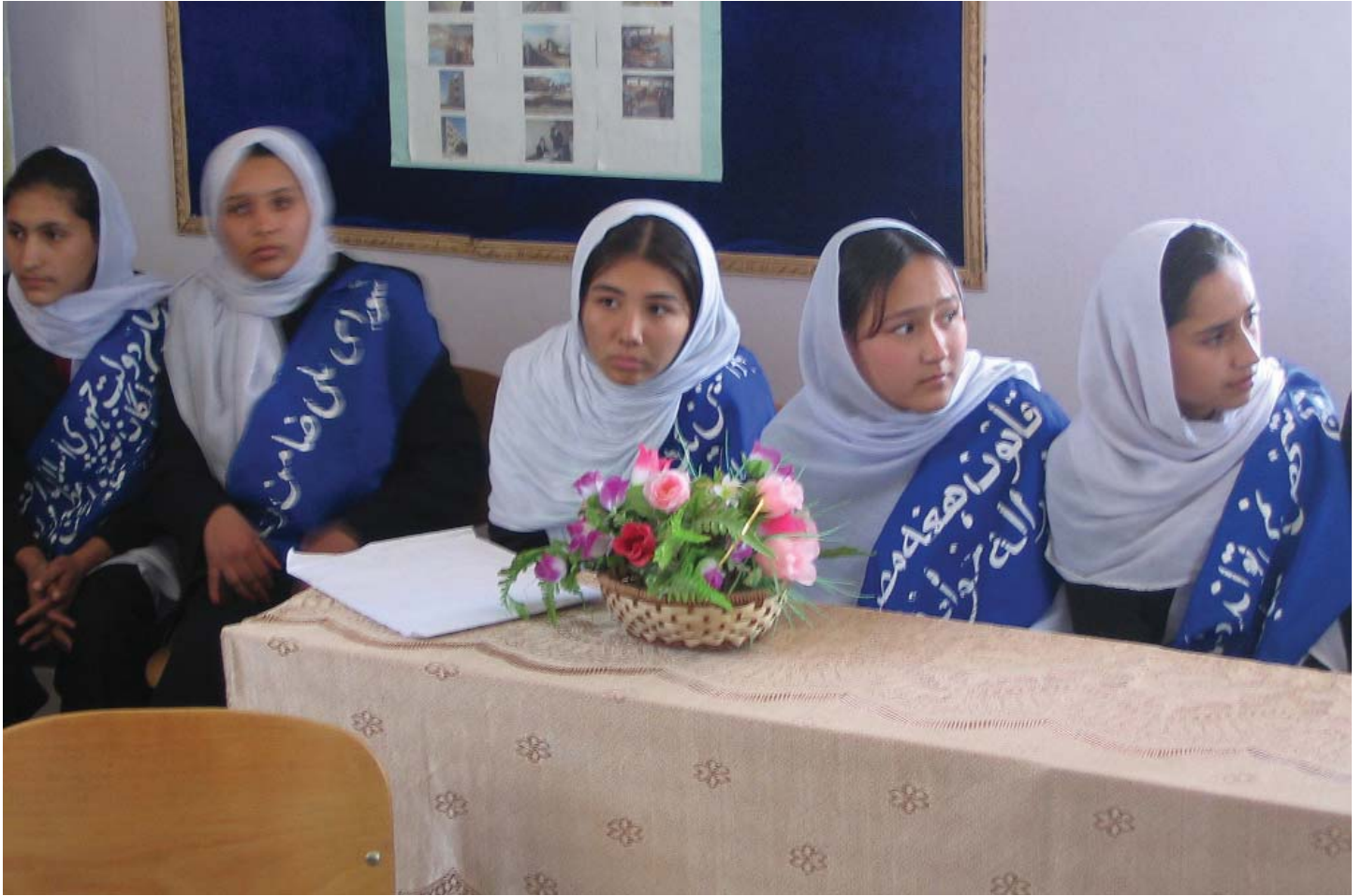
On the 29th of April , a project titled "Electoral Awareness" was implemented by the Afghan Liberty Foundation. The event was held in the Dasht-e-Barchi district of Kabul City. Over 1100 people, both men and women, participated in this event. During this event, the Youth Theatre Group performed a skit regarding the 2005 elections.