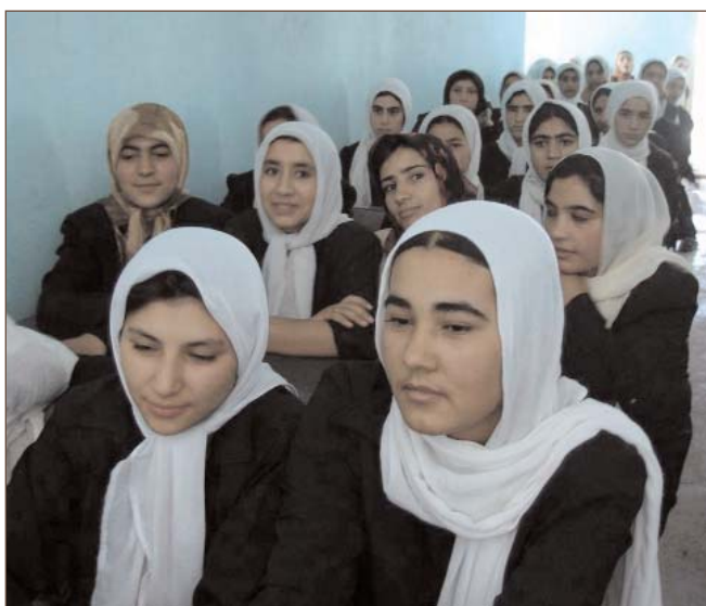
Students at a local High School near Herat gather to learn about voter registration during a Small Grants Program sponsored event.

"I see this as a sort of insurance that female candidates will be educated, literate and progressive," she said, "because this is their background. It is what they have learned."