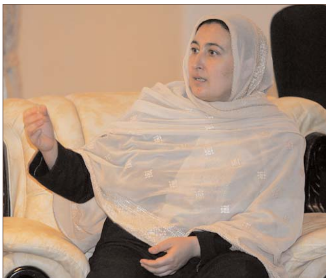
Minister of Women's Affairs, Masooda Jalal

"I am sure that all of these women are powerful," Jalal said of the female candidates. "I am certain that, insh'allah, if people provide enough support, women could become a strong power and maybe one day a majority in parliament. In each and every law they will make sure that women's status is promoted and protected, so that women's issues are equally considered and women benefit equally." ■