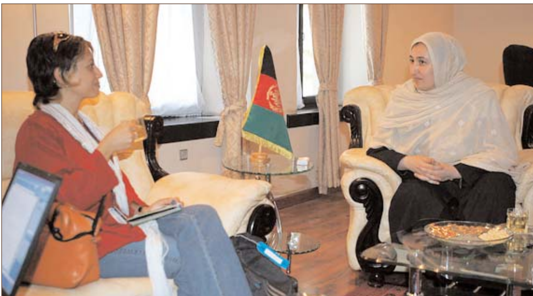
Minister of Women's Affairs, Masooda Jalal, meets with JEMBS Senior Gender Focal Point Lina Abirafteh to discuss public messages about women's participation in the upcoming September elections.

T here is an old adage that says that "a woman's place is in the home." Afghan Minister of Women's Affairs, Masooda Jalal, fully agrees.