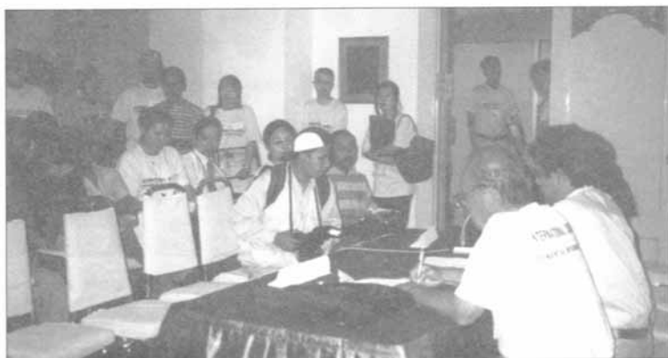
ANFREL spokespersons speak to the media at the opening of the mission.

Two press conferences were called during the mission. The first was at the opening on June 1 and the second was on the last day on June 10. The Mission Statements (copy as Appendix E and E-1) were read in both occasions. TV, radio and print media attended both conferences. Press releases were also issued (Appendix E-2 - E-3)