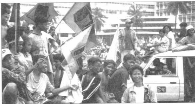
Children and young people formed the majority of campaigners.

It was also observed that in Indonesia, campaigning is not used as a venue to discuss and debate about economic and political issues and how the political parties would respond to these issues, but rather, they were used more to show their force through numbers and to pressure voters to vote for them using various forms of tactics. The campaign forms appealed to the general mood for change but in a very general and superficial way. The platforms could have been used to educate the people on the deeper meaning of democracy, human rights and peace.