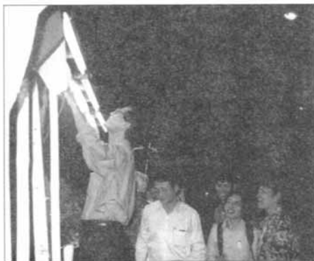
ANFREL Senior observers inspect a voters' list during ocular visit the night before the election.

Senior members of the mission assigned in Jakarta arranged meetings, on one level, with authorities of Indonesia to convey ANFREL's concern for a free and fair election. It was able to meet with President Habibie, General Wiranto and other members of the cabinet, the KPU officials, the Human Rights Commission and members of the diplomatic community. On another level, ANFREL met with concerned NGOs, academics and other members of civil society, including leaders of major political parties to express its solidarity and to share its experiences on processes of democratization in their respective countries. It met with KIPP, the local monitoring body, FORUM-RECTOR and other monitoring groups. It also met with YLBHI, with AJI. It also met with media and other sectoral groups such as women, religious groups, etc. It met with Volunteers for Humanity, an organization working for victims of human rights violations and had the opportunity to talk with some of the victims themselves.