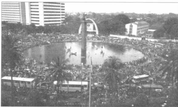
The last day of the campaign when all parties paraded at the main roads in Jakarta.