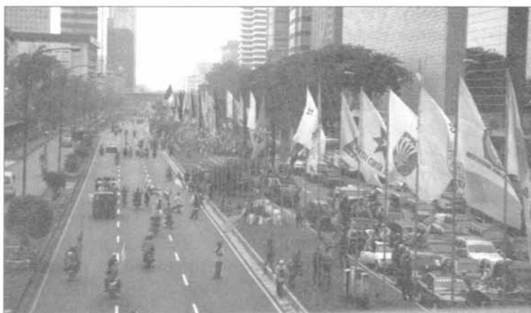
Party banners lined up along the main thoroughfares of Jakarta.

Campaign materials in the form of balloons bearing the color symbol and names of political parties were flown within the 200 meters from the polling stations even during election day. These were seen in some TPS in Jakarta i.e. in TPS No. 4 JL Perjuangan, Kel. Haragan Barce, Kel.Bekasi, Utara, Kab. Bahasi, and Java Barrat. Children claimed that they were paid 1,000 rupiah per balloon. This also happened in Ambon, West Kalimantan and Surabaya. Others distributed stickers and leaflets during actual election. The political parties involved in these violations of election rules are Golkar, PAN , PDI-P and PPP.