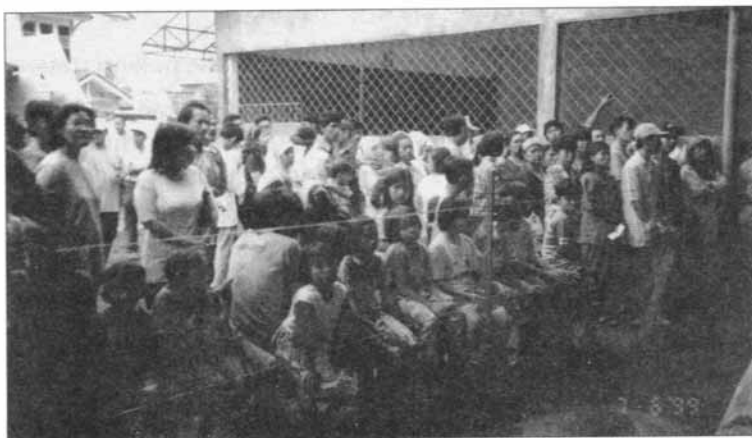
Children and adults stayed near the polling station to watch the counting of ballots.