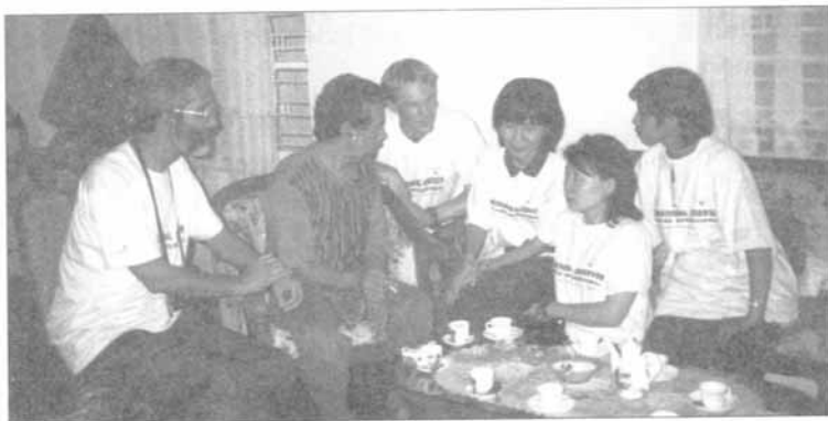
ANFREL Observers visit Xanana Gusmao, East Timor leader on house arrest in Jakarta.