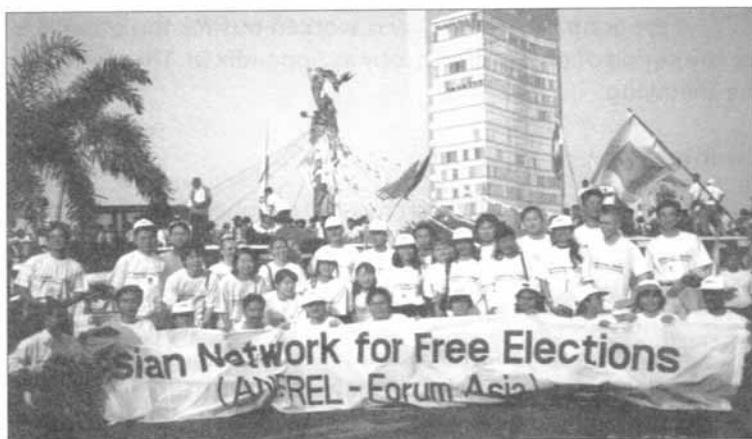
ANFREL observers pose in front of Hotel Indonesia before deployment to their respective assignments.

The Observation Mission was planned and conducted in two parts: the pre-election and actual election missions. The pre-election mission covered the voter registration and the campaign period and the actual election covered the actual polling and counting process. The pre-election mission was held following the seminar-workshop of journalists, allowing the participants direct experience in monitoring the process. A separate report was also produced on this mission and is available.