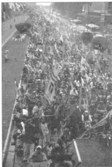
PPP in a show of force during the campaign.

In Jakarta and other town centers, campaigning consisted mostly of massive show of force in forms of transport caravans, rallies and marches. Political parties took turns in the streets with their colorful party costumes and campaign paraphernalia. Party flags lined up along the main roads and posters and banners posted on billboards and walls. It was observed though that majority of those who joined these activities were young boys and girls who are not eligible to vote.