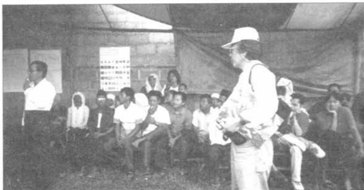
A ceremony marking the opening of polling day in a station in Central Java.

voters reduced from 95% to 88.83% due to similar reason. In Solo, the voting reduced because of fear that the riot that happened earlier will be repeated during the polling day.