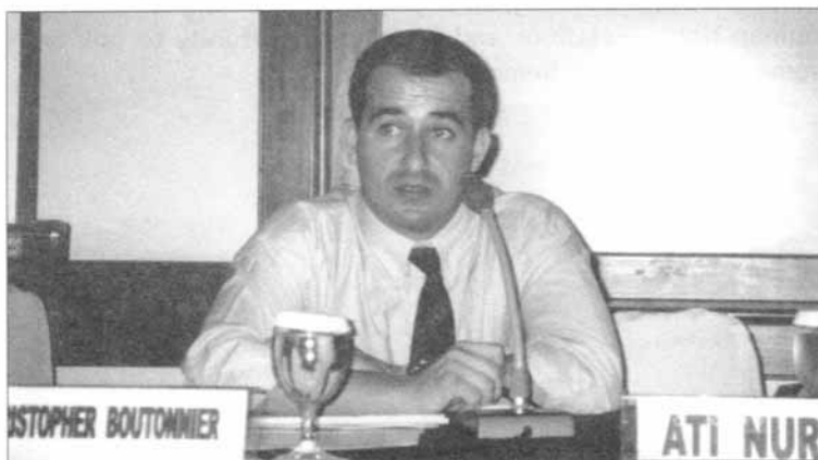
UNDP chief security officer briefs ANFREL observers on security during elections.

Some inputs were given by experts in the field and which were used for discussion and further analysis. The evening was spent for preparation for deployment. Teams were organized and briefed about their areas of assignment. Medical/first aid kits, T-shirts and caps were also distributed.