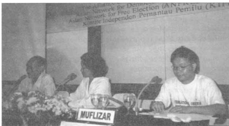
KIPP officials brief ANFREL observers about their work and mechanics for coordination.

Some inputs were given by experts in the field and which were used for discussion and further analysis. The evening was spent for preparation for deployment. Teams were organized and briefed about their areas of assignment. Medical/first aid kits, T-shirts and caps were also distributed.