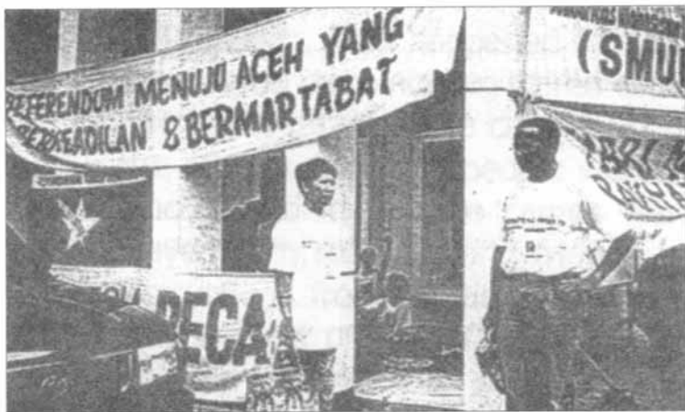
ANFREL observers visit Aceh protesters in front of KPU headquarters.

Groups and individuals supporting Aceh staged a hunger strike in front of the KPU headquarters to call the attention of the election authorities on the situation in Aceh. They demanded for the immediate pullout of the military as a prerequisite for a free and fair election in this war-torn province.