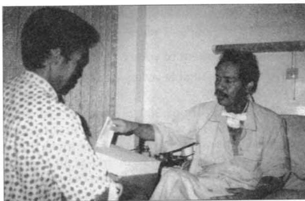
A patient casts his ballot through a mobile polling station set up in a public hospital in Jakarta.

Secrecy of the ballot should always be guaranteed. In one public hospital in Jakarta whose director was known to be a Golkar supporter, a mobile polling station was set up for the patients and their relatives and friends. The voting was done so fast that in some instances, the patients voted openly with many people around and in other instances, the process was done without the presence of the party witnesses and observers.