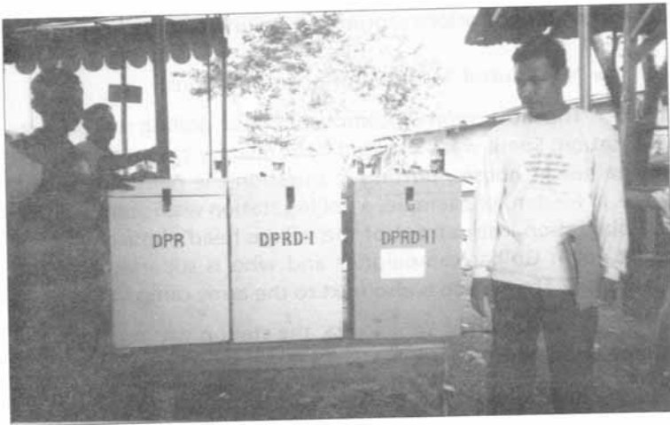
Ballots and ballot boxes were observed to be of poor quality, with low-grade paper and defective locks used respectively.

actually tried and wash their hands after and found the ink completely gone. The paper used for the ballots was also of substandard quality. In Pontianak, West Kalimantan, many ballots were considered spoiled because there were pinholes in the paper, large enough to cause confusion over the punch made by the voter. In some areas, the ballots had to be discarded totally because of its poor quality. The ballot boxes were also complained of not having safety features. Some of the locks are destroyed. In Kupang, observers complained of defective ballot box seals but local polling officials could do nothing. It was observed that even those not destroyed can easily be opened.