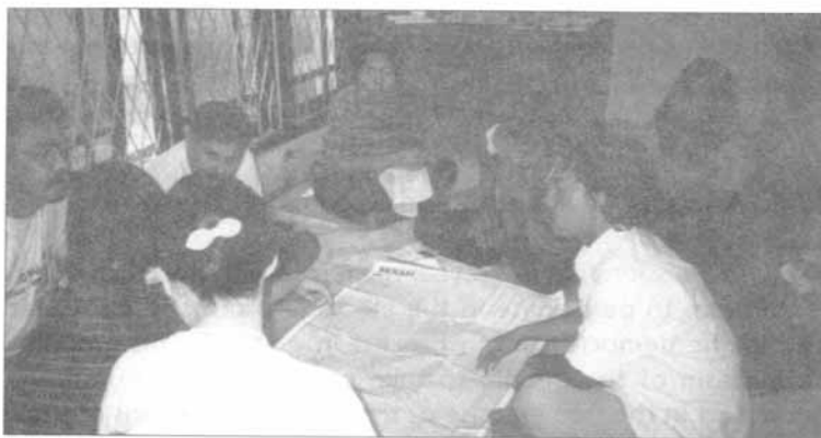
KIPP volunteers brief ANFREL observers.

The presence of observers, both local and international had in one way or the other provided encouragement and confidence for people to go out and vote, especially in conflict areas like Ambon, Madura, Aceh and East Timor. In some polling stations, observers were asked some advice on matters that needed to be corrected during the polling and counting. Observers were welcomed in the areas and even inside polling stations. Polling officers welcomed them and had been cooperative in terms of answering questions and openly showing them the process. There were cases though where the international observers were harassed and given a hard time. In Denpasar, the observers were assigned two intelligence police who escorted them everywhere they went.