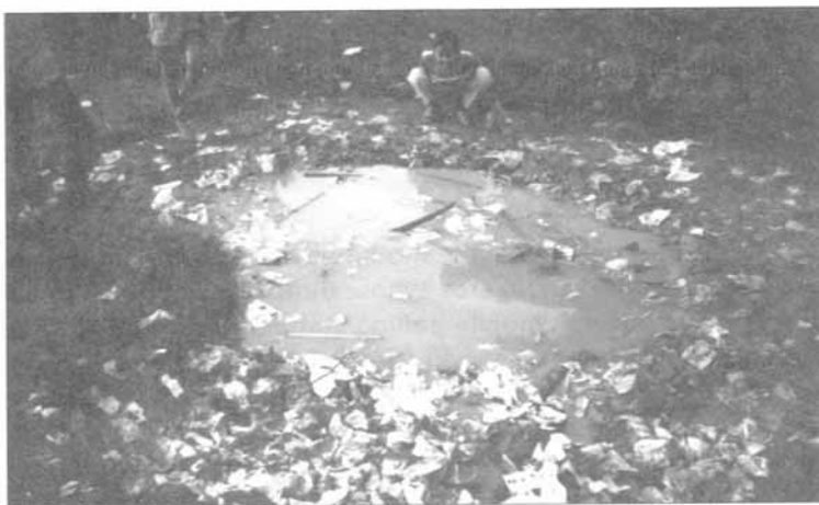
ANFREL observer shows used ballots thrown in the paddy by angry voters.

In some areas, they used transparent curtains so that people around could see clearly the person voting. In some stations, people outside the booth could directly see the voter voting. In one station in Jakarta, the booths were located opposite the windows where people could directly see what the voter was voting.