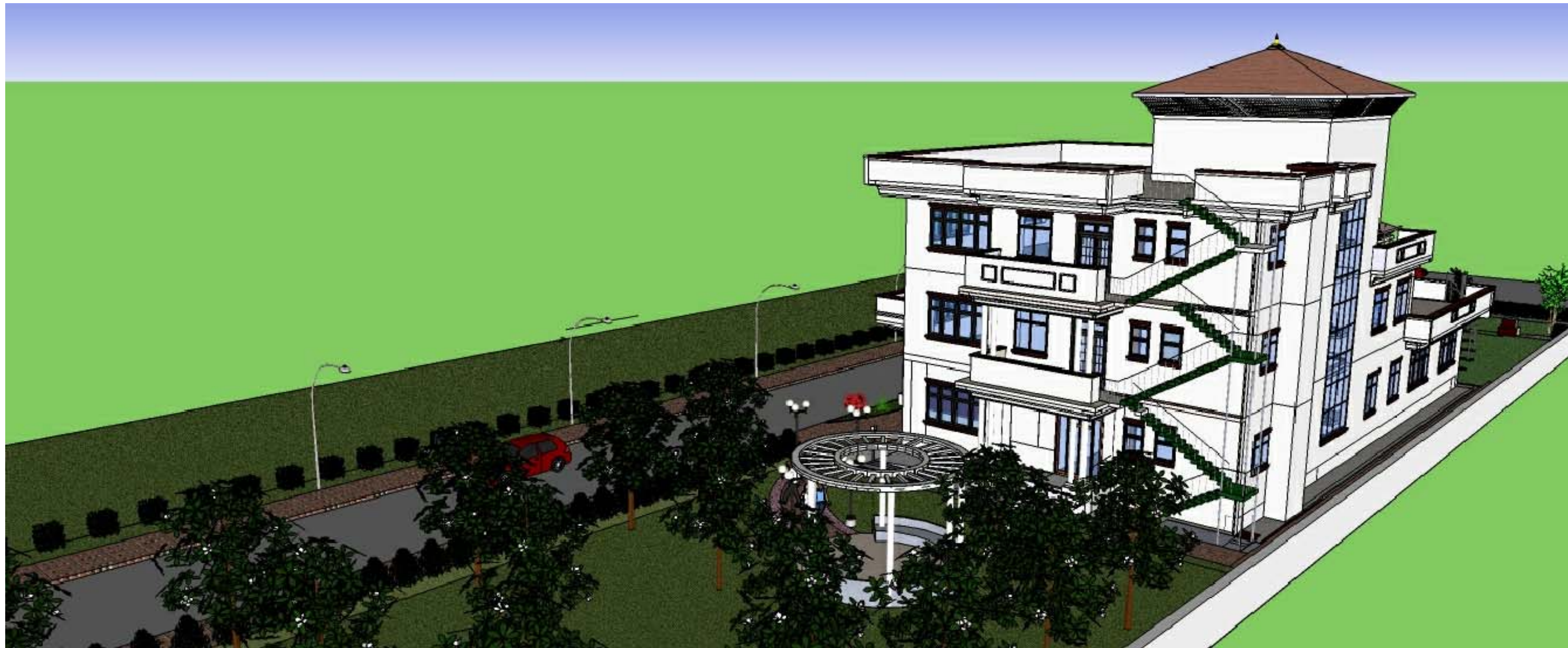
A View from South West Corner

PROJECT: ELECTORAL EDUCATION AND INFORMATION CENTER (EEIC), ECN, KATHMANDU, NEPAL