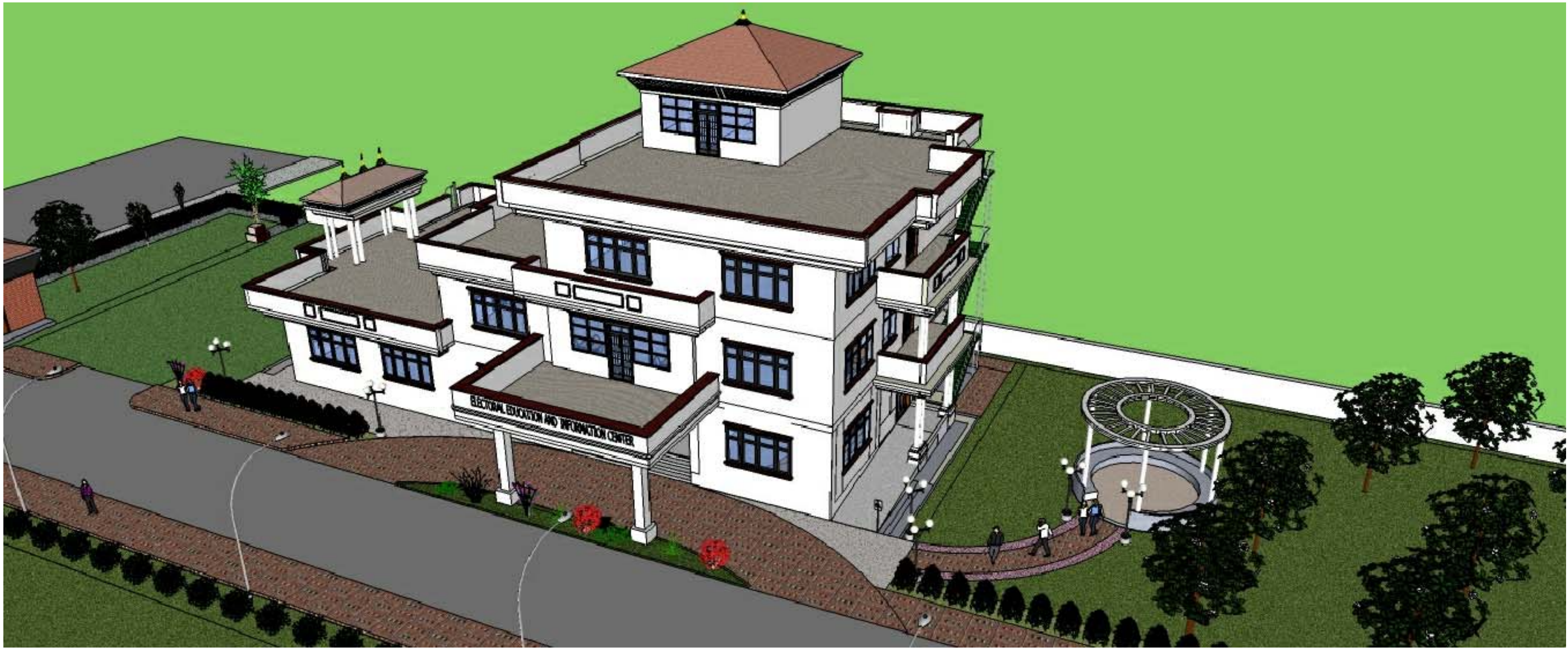
A View from North West Corner