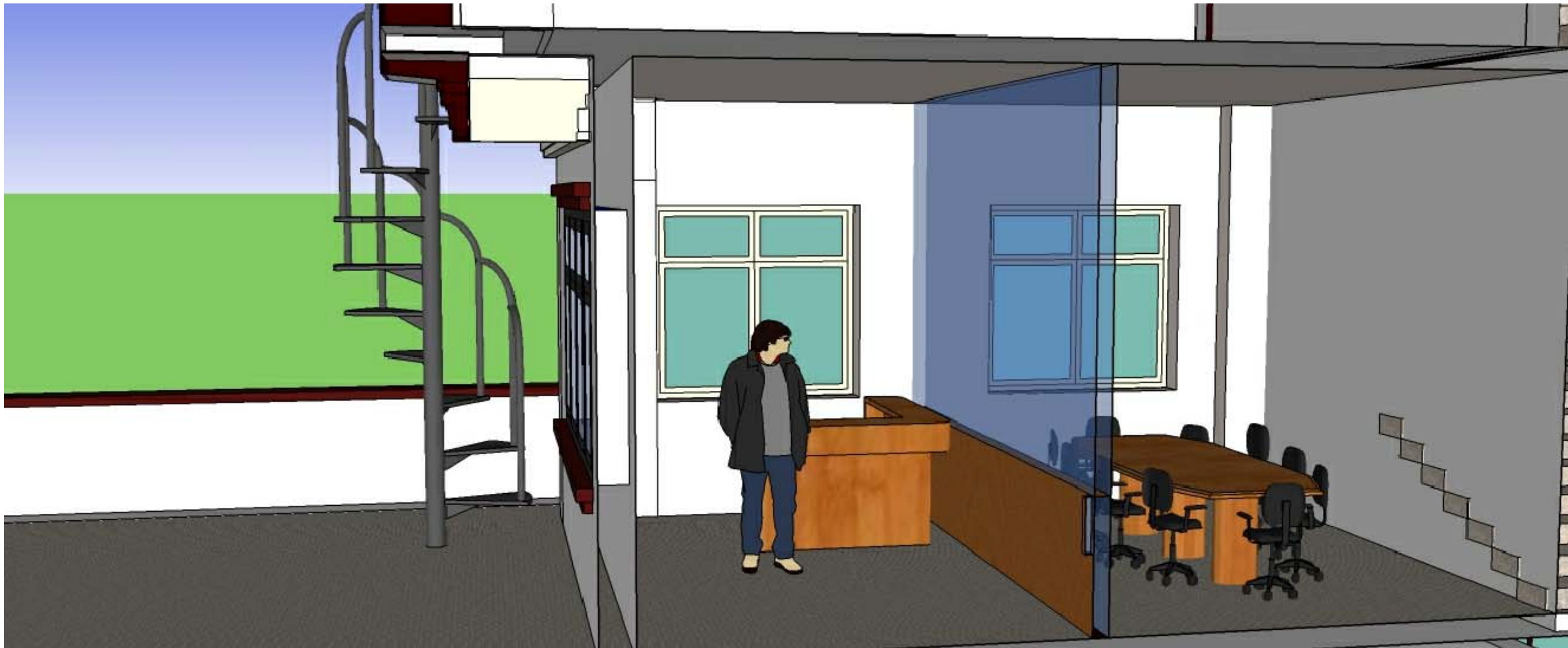
Sectional View of Office-First Floor