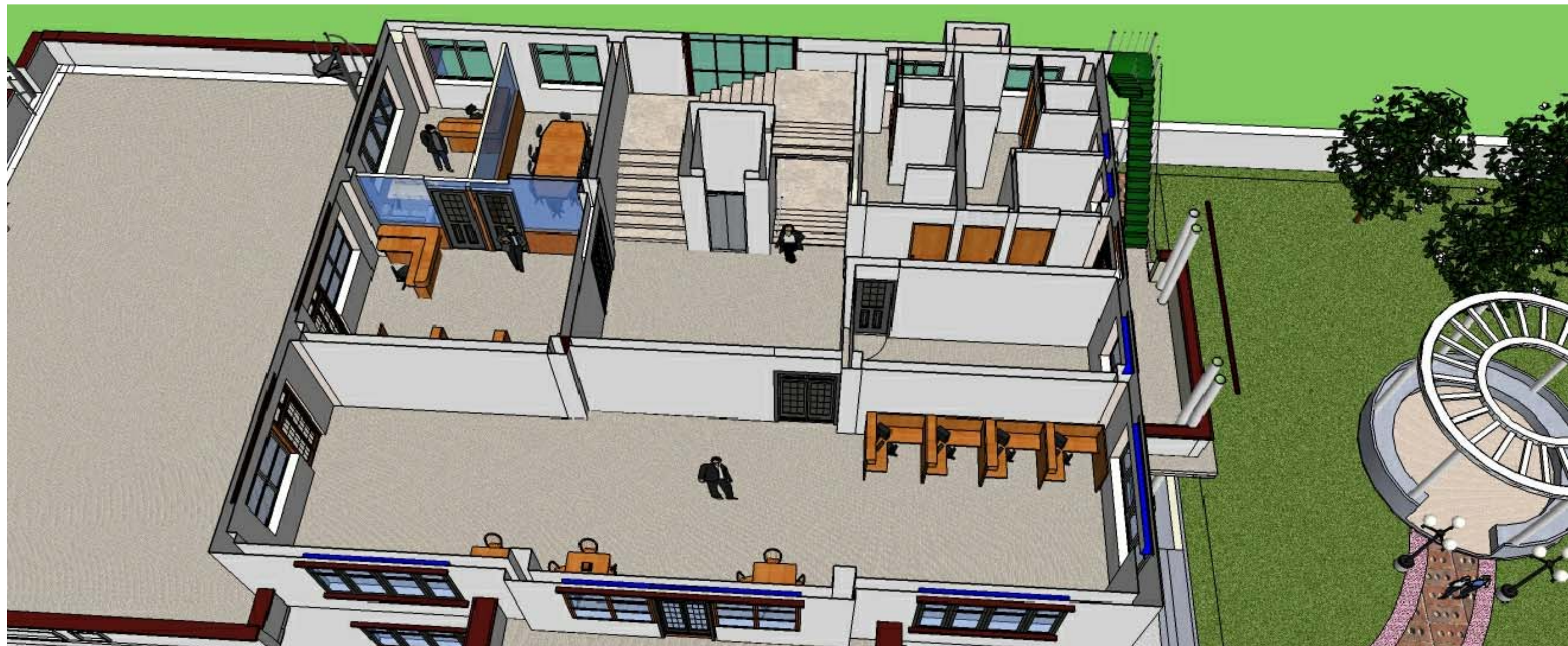
Sectional View of First Floor

PROJECT: ELECTORAL EDUCATION AND INFORMATION CENTER (EEIC), ECN, KATHMANDU, NEPAL