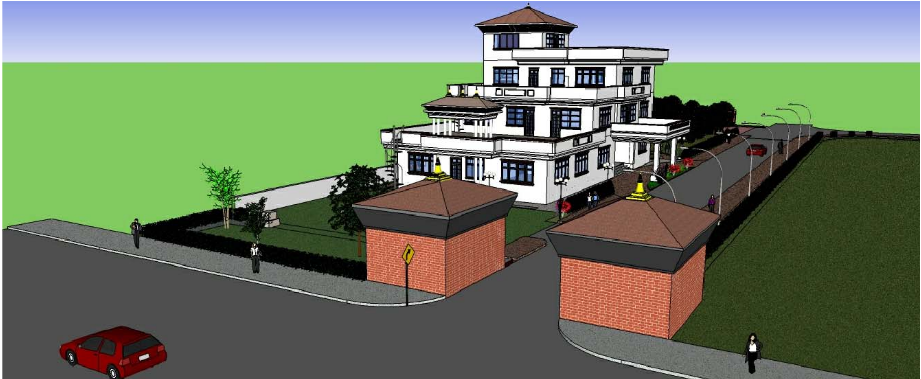
A View from Main Road