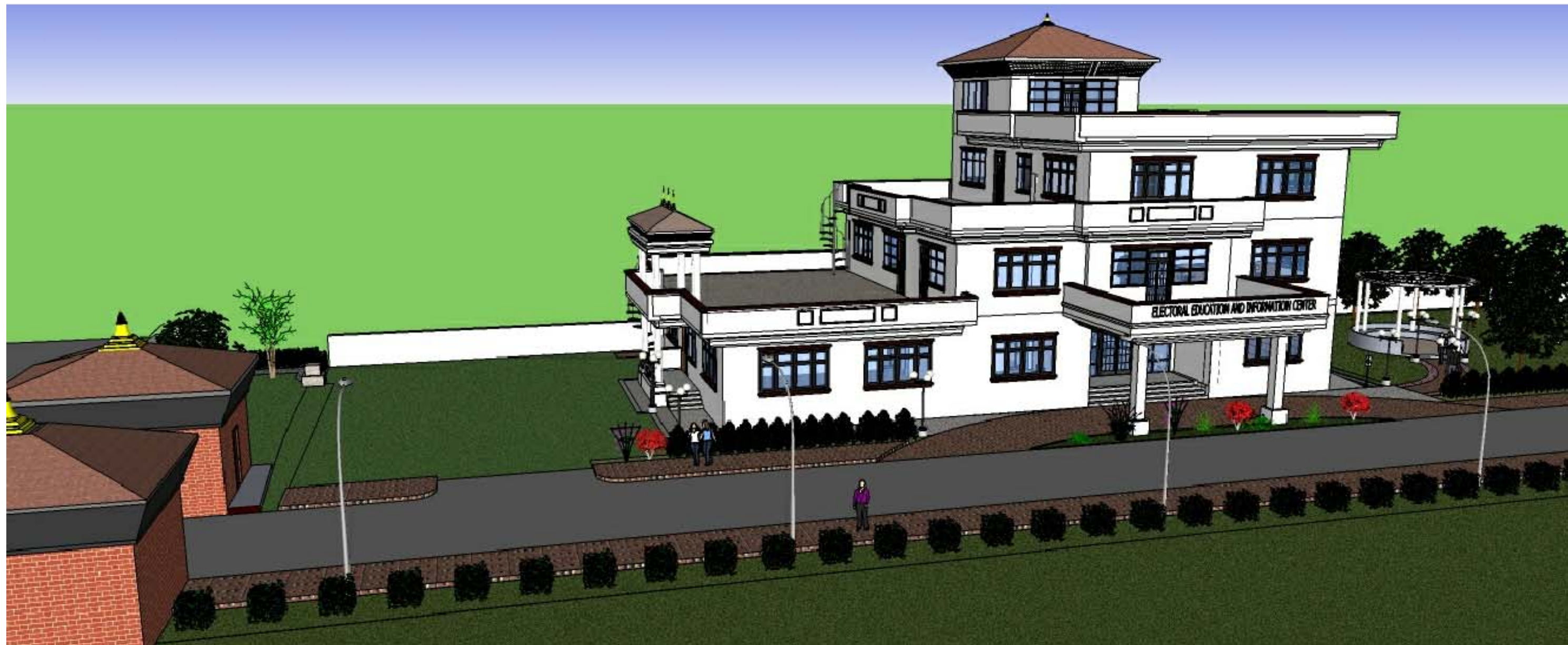
A View from North East Corner

PROJECT: ELECTORAL EDUCATION AND INFORMATION CENTER (EEIC), ECN, KATHMANDU, NEPAL