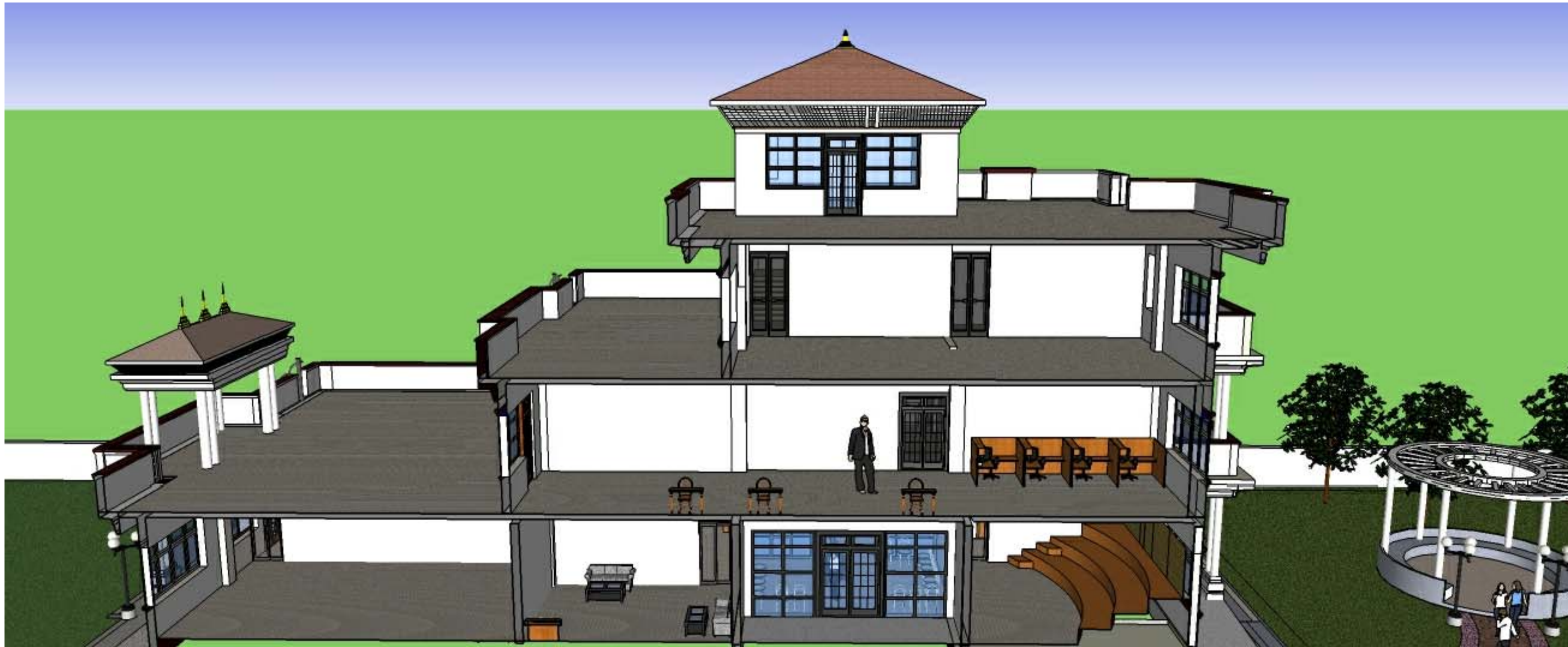
Sectional View of the Building