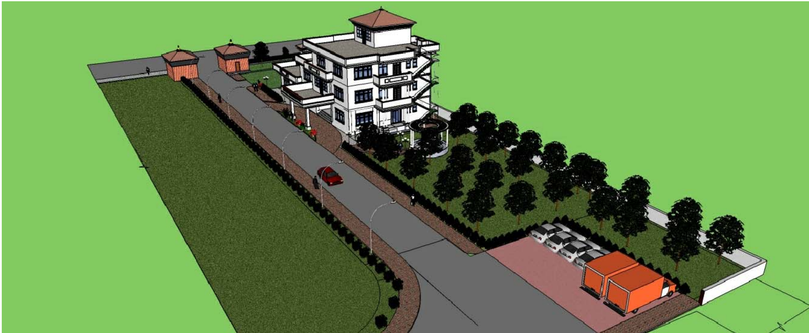
Overall View of the Building from North West Corner

PROJECT: ELECTORAL EDUCATION AND INFORMATION CENTER (EEIC), ECN, KATHMANDU, NEPAL