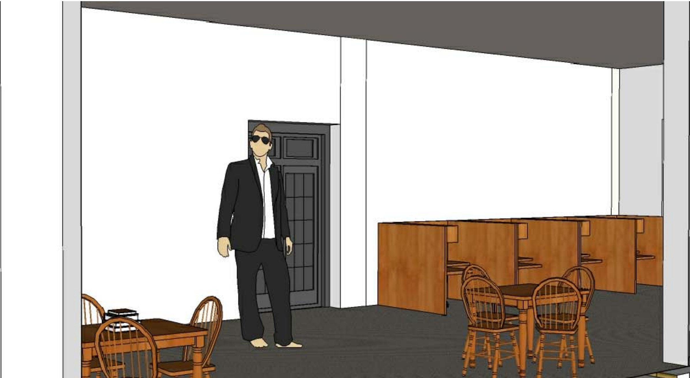
A Portion of Library-First Floor