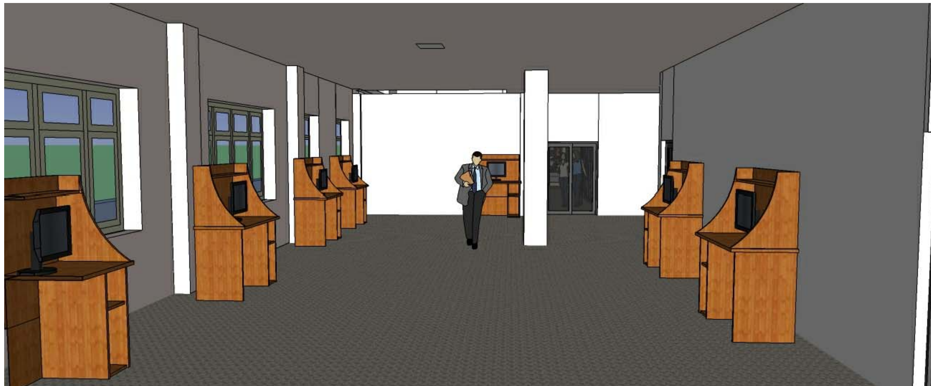
A View of Learning Station-Ground Floor

PROJECT: ELECTORAL EDUCATION AND INFORMATION CENTER (EEIC), ECN, KATHMANDU, NEPAL