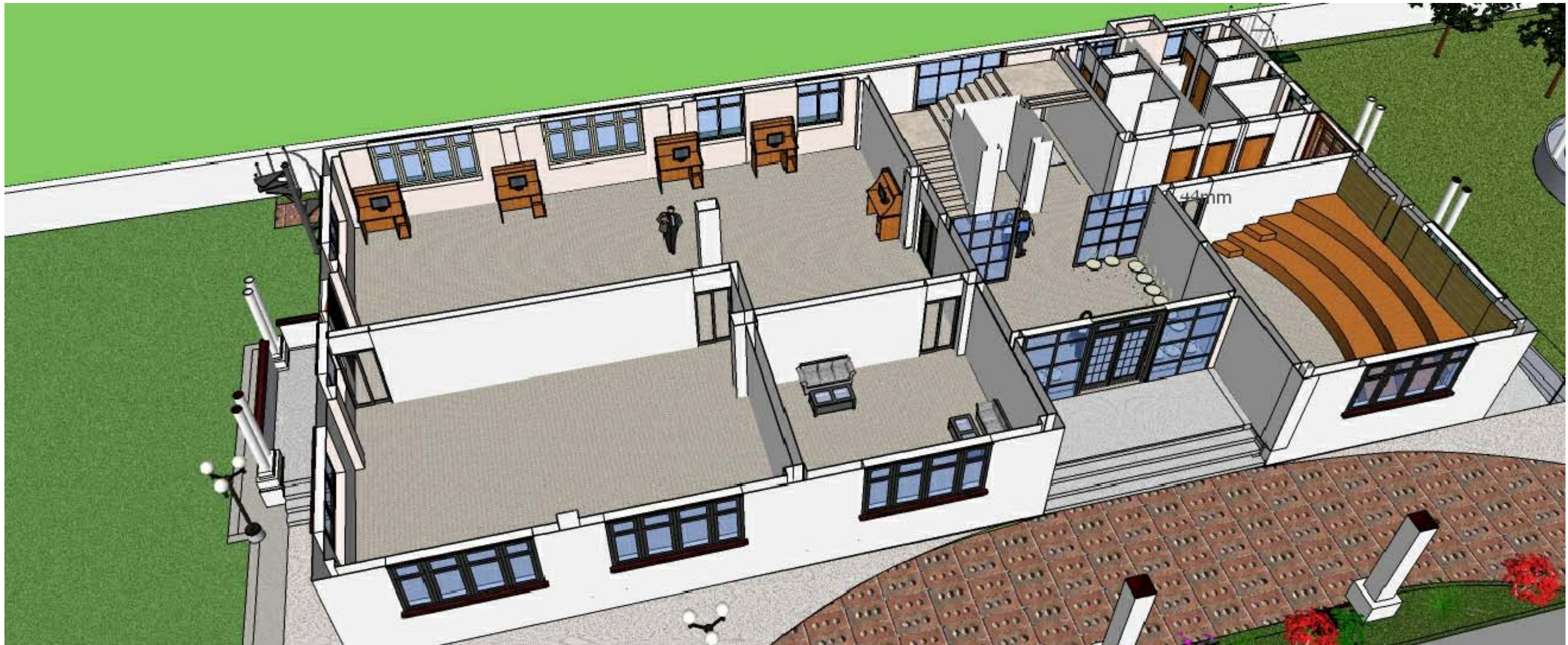
Sectional View of Ground Floor