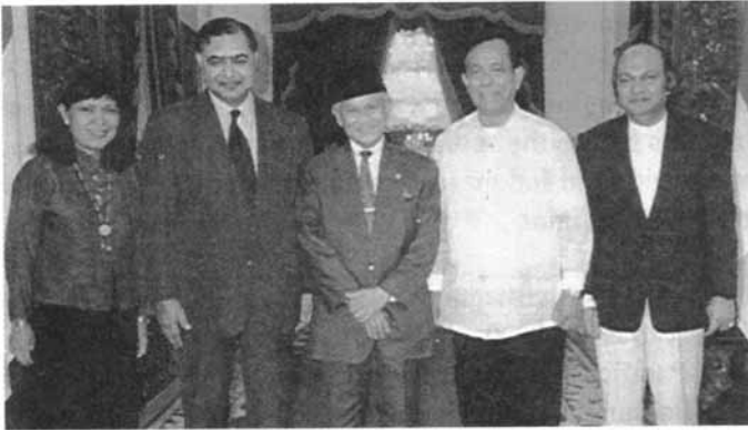
High level mission members composed of Senator Aquilino Pimentel (Philippines), head of the mission, former Foreign Minister Kamal Hossain (Bangladesh), Dr. Chaiwat Sath-anand(Thailand) and Evelyn Balais-Serrano (FORUM-ASIA) met with President Habibie to appeal for peace and respect for human rights in East Timor. They also called for the immediate release of Xanana Gusmao and other political prisoners in Indonesia and East Timor.

One of the missions sent to Indonesia to address specifically the violence in the run up to the general elections in Indonesia, was a high-level mission comprising of representatives from Philippines, Thailand and Bangladesh held on May 5-6, 1999. The mission lobbied the Indonesian government to stop the killings in East Timor and to release immediately East Timor's leader, Xanana Gusmao and other political prisoners in Indonesia and East Timor.