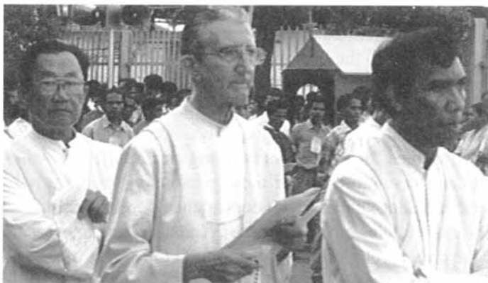
Local people led by priests and nuns marching around Dili to call for peace and reconciliation in the run up to the popular consultation.

Because of their humanitarian concern, they are generally perceived by pro-integration forces to be supportive of pro-independence, making them targets of attacks by the former. Bishop Belo's residence was burned at the height of the militia rampage after the vote. Among those killed during the rampage was a missionary priest.