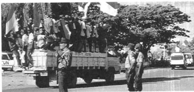
Pro-integration supporters dominated the campaign with long motorcades and noisy rallies, oftentimes culminating in killings, torture and other human rights violations .

were inquiring initially about the observers' destination. The militia person grew more violent as the conversation was progressing. He banged the sides of the car with his fist and then started to poke the driver's assistant who was riding with the rest of ANFREL observers at the back of the minibus, with a screw driver while some of the policemen were watching. He grew angrier when some members of the team attempted to prevent him from hurting the assistant. Tension grew high and the police intervening to convince the militia person that the observers were only foreigners and that he could let us go back to where we came from. In another incident ANFREL observers had a teenager militia member stopping the car with a homemade gun pointed at all of them. A brief conversation with the driver, the young man gave the observers a thumb up and let them go. The observers were told through the interpreter that the driver told him that the observers were heading towards Bishop Belo's house.