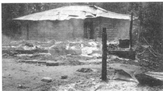
After polling day militia groups started burning houses and entire villages.

Most of ANFREL teams had to go through various militia roadblocks to make it to the polling stations where they would be observing the process. Signs of intimidation and violence were evident throughout the territory. The night of the same day, offices of the CNRT were also attacked. The next day (August 28) a number of people left and most shops remained closed in Maliana. By noon of the same day, roadblocks were up and the militia was said to be preparing for another showdown. Several days, after the vote, while Dili is being described as “a living hell”, Maliana was said to be a town of smoldering ruins and unspoken atrocities.