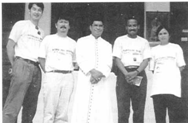
First mission members with Bishop Belo after their meeting.

For the first report, the mission took note of the following observation: