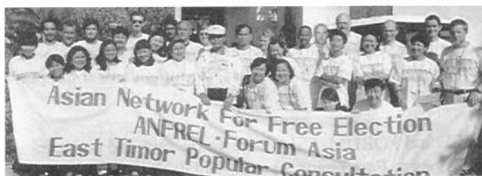
ANFREL monitors pose outside the Boy Scouts headquarters in Dili before their deployment.

The mission was composed of forty-two (42) monitors from fourteen countries in Asia and the Pacific (35), North America (4) and Europe (3). (list of mission members in Appendix Section). They are lawyers, academics, doctors, human rights NGO workers, religious, development agency representatives, journalists and professionals involved in various democracy and human rights-related work. Some of them are heads of their organizations and some are program and technical workers. Of the forty-two members, sixteen are women.