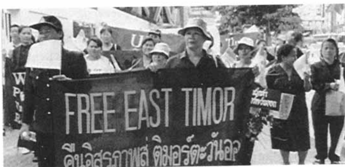
Thai NGOs, academics, students and other sectors march to the Indonesian Embassy to pressure the Indonesian government to respect human rights of the East Timorese people.

A Campaign on Violence Against Women in East Timor consisting of forums, marches, interviews before the media and meetings with the Prime Minister of Thailand and other concerned authorities was conducted which culminated in the formation of the Women Coordinating Committee for East Timor.