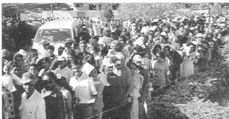
A sea of people greeted the day during actual polling across East Timor on August 30, 1999.

Later, talking to a community leader, he explained: 'It was the people's way of overcoming their fear – that if they came alone or in a few number, they could be attacked and harassed and forced to return by the pro-integration forces. But if they came together, no one could stop them because they were superior not only in number but in strength. It was a strategy.'