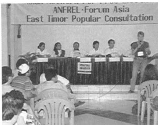
ANFREL observer sharing her experiences in Ambeno during a press conference.