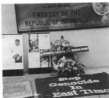
Demonstrators put flowers, photos and streamers in front of Indonesian Embassy to protest atrocities and other human rights violations in East Timor.