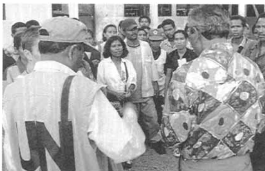
UNAMET personnel briefing local election workers.

Under the New York Agreement signed on May 5, 1999, the UN Secretary-General shall have the responsibility and authority to monitor and verify 'compliance' of both parties, Indonesia and Portugal to this Agreement. As a mechanism to enable him to