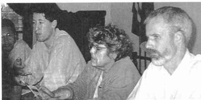
Canadian parliamentarians and diplomats share their observation and analysis with ANFREL monitors.