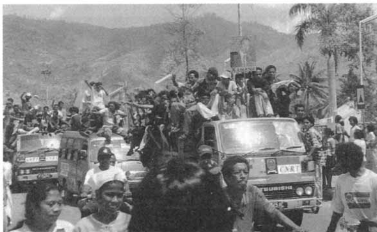
Pro-independence supporters show their force during the last day of campaigning.

Across the territory, as early as 4:00 o'clock in the morning, voters were starting to queue at their respective polling stations. In many cases across East Timor, voters had to walk overnight to be at their polling stations on the day of voting. Some of those interviewed said they wanted to make sure they would be able to cast their vote. They said they knew that there would be attempts by pro-integration groups to stop them from voting e.g. setting-up road blocks and checkpoints so they made sure by coming the night before.