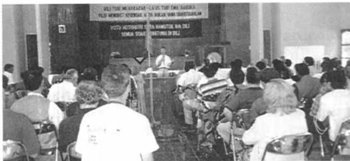
ANFREL joins other observer groups during UN briefing at the UNAMET office.

not all of other monitors present in their respective areas of assignment.