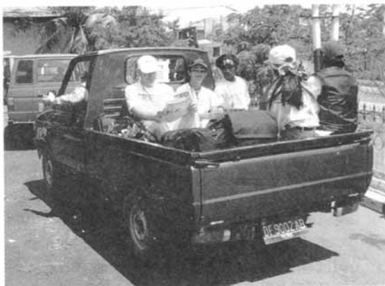
Observers deployed to Manatuto and Baucau get ready for their trip.

The choice of areas for deployment was made in consultation with the local NGOs and contacts on the basis of accessibility of areas, availability of transportation, local contacts and interpreters and the security situation.