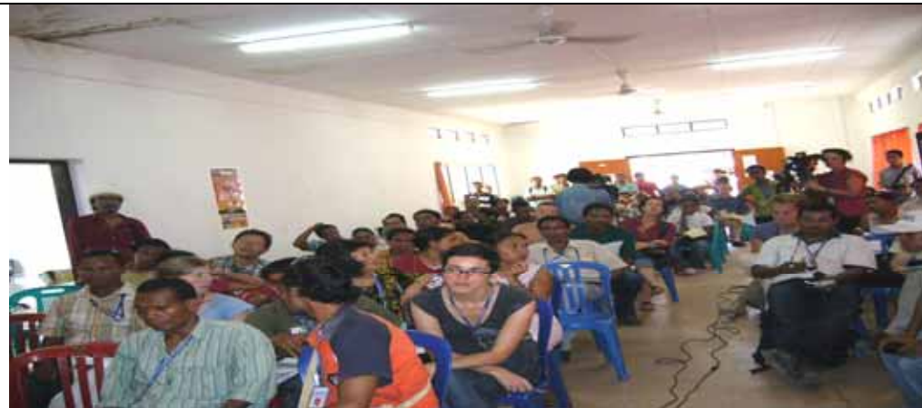
ANFREL-KOMEG Press Conference in Dili – April 12, 2007

During the presenting in East Timor and observing the process, ANFREL was issued 2 statements 39 , the 1 st statement was released to media during pre-election period. The statement aimed to call for the election commission to take care about the voting condition for Internal Displaced Persons (IDP's) who were lack of security. There was high possibility of violence when IDP people went to vote at polling station outside due the racial conflict. For these issued, the Mobile Ballot Boxes or escort security unit should be provided for them to go to the nearest polling station around the IDP's camps.