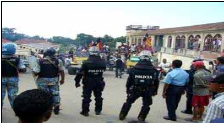
Full security alert on April 3 rd in Baucau during Horta's and Lu-Olo's campaign events, which ran at the same time

In Viqueque; ANFREL observed that Liqueur district was a very difficult area to campaign in for opposition candidates because Fretelin have a very strong base there. Ramos Horta, Fernando Lasama (Democrat Party) and Lucia Lobato faced difficulties in holding their campaign events there because some groups came to interrupt during the campaign. The ways in which they interrupted included drunk men shouting and making noise, stepping on or crushing plastic bottles containing drinking water to make a sound like a small bomb and throwing stones at the people who had gathered for the meeting. Fernando Lasama's Convoy was blocked by an unknown car but the police were able to resolve the situation and after that the candidate could return to Baucau.