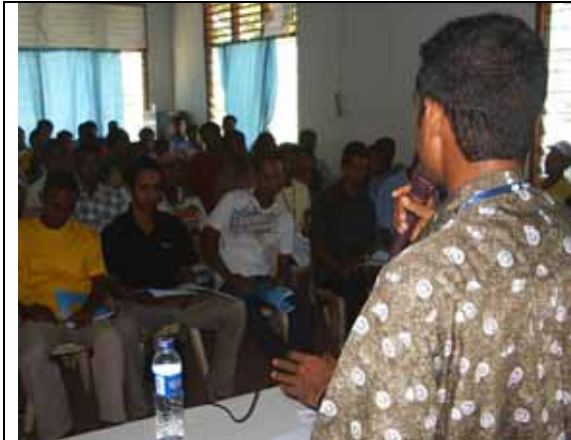
One Father (priest) give a brief for KOMEK Observer in district