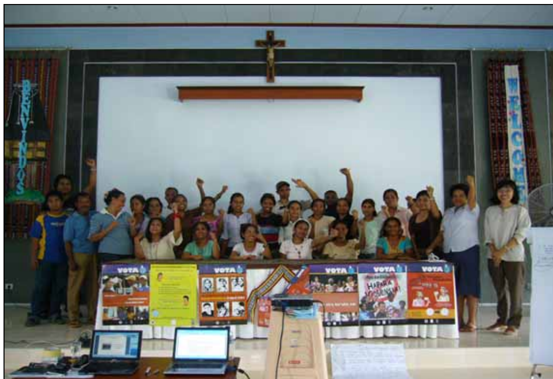
ANFREL and Women Caucus training participants at the end of session

CNE Commissioners attended the training and were willing participants in the session, including addressing a Code of Conduct for national observers. The training emphasised the importance of voter education for women at the grass-roots level. The training concluded with a confidential evaluation by each participant of the training process.