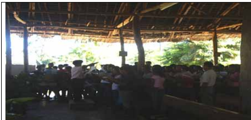
A group of youths gathering at the church before receiving Civic education from ANFREL

The session ended close to midnight after the organizers pleaded with the participants to get some rest! The next morning, after the participant had rested and eaten breakfast, the training continued for the next session. The ANFREL trainer joined the class in the afternoon due to difficult road conditions and made a presentation about the observation methodology and the polling process simulation with similar scenarios as in the training sessions in the Bobonaro district.