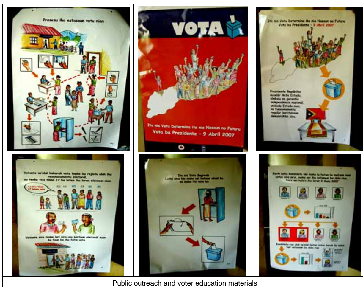
Public outreach and voter education materials

The STAE and UNDP have a good strategy and planning for public outreach and voter education through posters, leaflets, banners, and media press access. However we feel this is not enough and not aimed at the right target. More than 65% of the population are illiterate, have no media access and live as farmers or fisherman. In the future it will be important to increase the quantity and duration of face to face training. For example when we observing the evening voter education session for some communities conducted by STAE in Dili we noted the sessions were very brief, didn't clearly explain everything, and not all the material was covered.