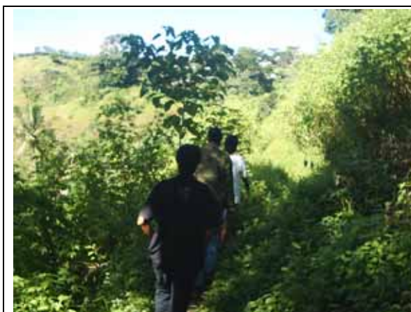
Walking through the hills to reach the interview place

After two hours walking through jungles and across hills the KOMEK observers were very worried that this community was fanatic and radical and for security reasons only male observers continued. When I arrived in this village, the atmosphere wasn't good as many of the young villagers started to surround us with unwelcoming faces.. We almost ran away, but after a good start, some helpful tricks and showing genuine friendship, these initially hostile youth members were friendly and brought us to their leaders. Since that time everything became under control and the interviews were very successful. The KOMEK observer was excited to enter the community is not as difficult as previously thought.