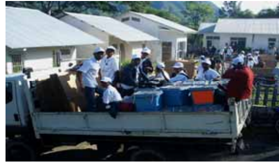
Logistics transfer activities

STAE in district office distributed the material out from the district level to polling centers a day before Election day, STAE in district Manufahi organized the ceremony to hand over logistics from STAE to the PNTL (Policia Nacional de Timor Leste) together with UN Police as the body in charge to secure the delivery process. They will transfer all the materials and security officers to every polling center. The ceremony was attended by the Secretario Estado Regiaun III, representative from the Ministry of State Administration, UN Police district commanders, PNTL District Commanders and CNE, STAE, all Brigada from polling centers and other observers. At the end of the process the material was loaded into vehicles and transferred using trucks, vehicles and helicopters. The material, together with the Brigada, left for the polling centers escorted by PNTL and UN Police. In the meantime the hand-over process in the District Ainaro was attended by the Minister of State Administration. Unfortunately not all districts had a ceremony or a procedure of this kind.