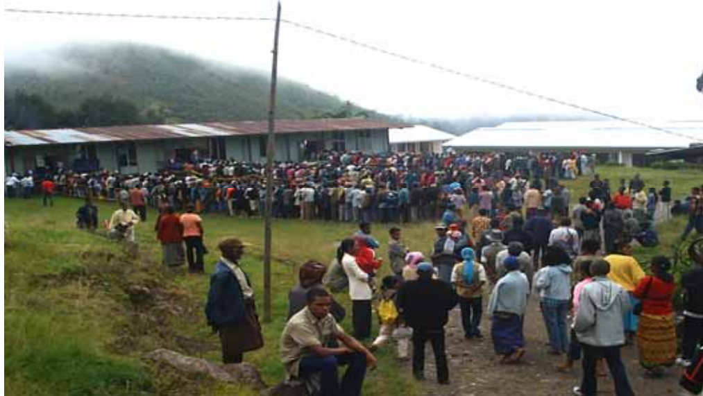
The voters queuing at the polling stations, before voting begins