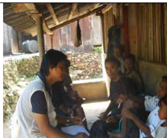
Interview with the leader of CPDRDTL in Bobonaro