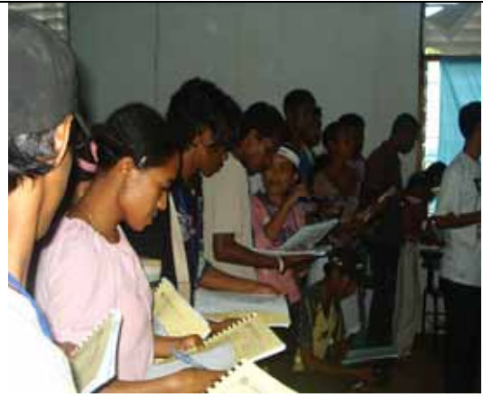
KOMEK in Bobonaro with checklist, observe the polling simulation

ANFREL initiated a simulation of the polling process in order to assist observers with what to expect during the polling processing. The trainers asked the students if they could see any electoral violations or cheating inside polling station during the simulation.