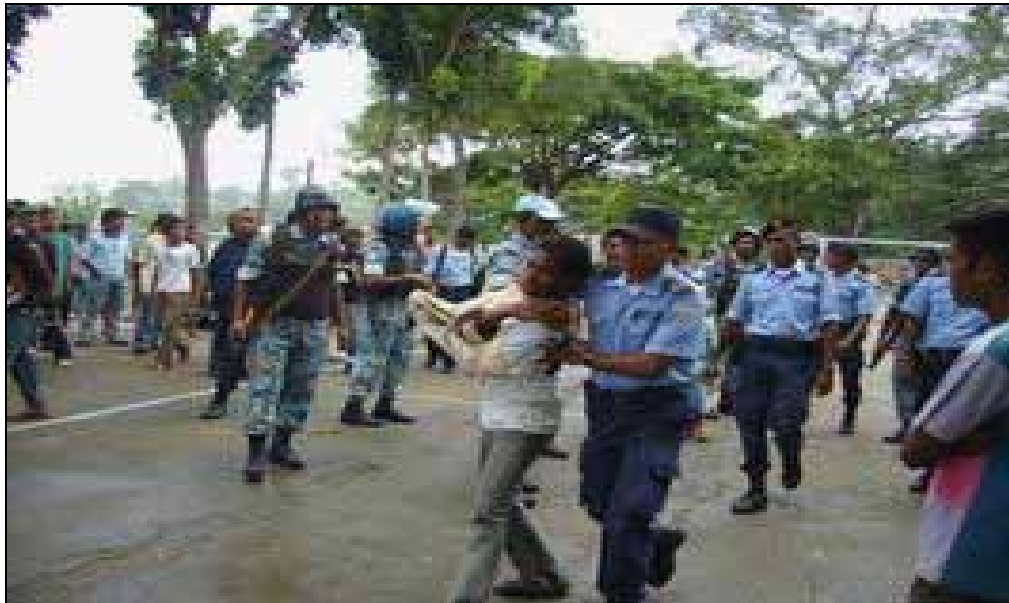
Police arrested the interrupt man during Lasama campaign in Baucau