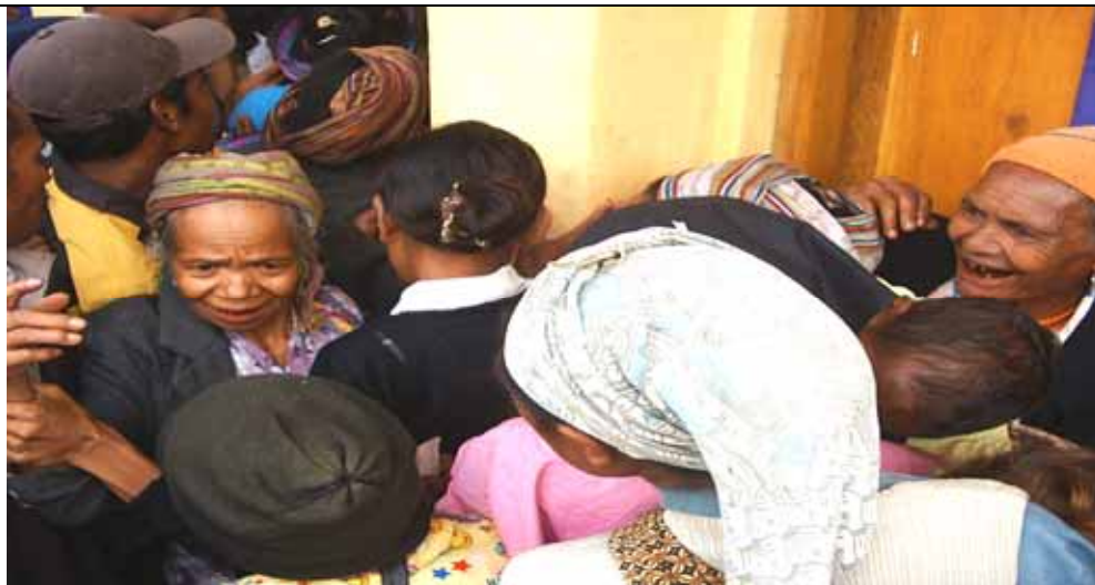
Crowded voters with only a single entry-exit door