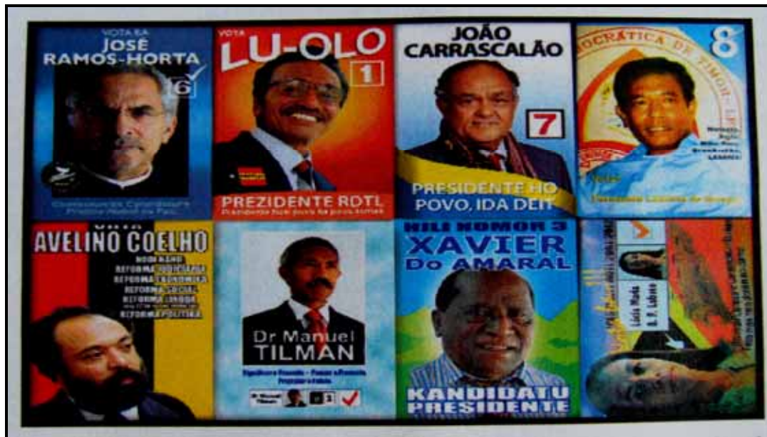
The 8 candidates' campaign posters