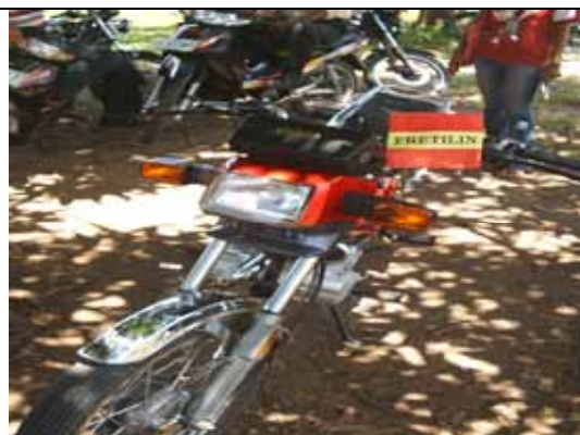
Government motorcycle used by chief of village to campaign for one candidate