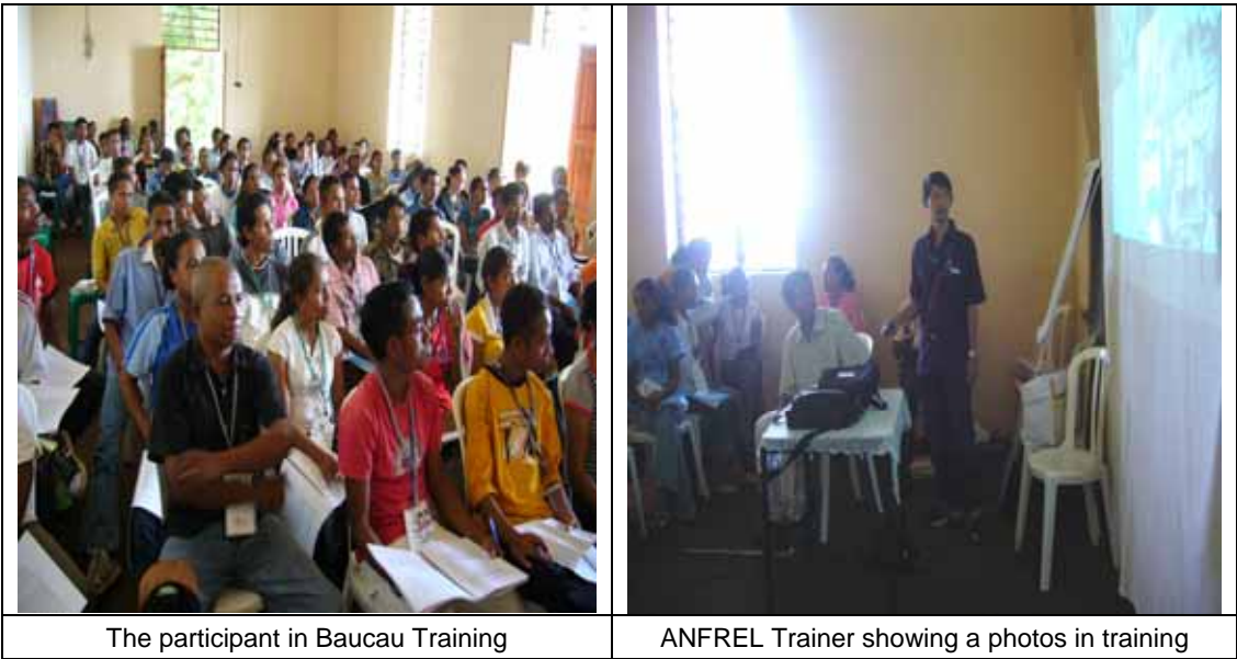
The participant in Baucau Training

The training was managed by KOMEg district coordinators and was attended by more than 97 KOMEg observers. Obviously this session was different from the previous Training of Trainers (TOT) session as this training aimed to prepare KOMEg field observers to be ready to perform observation on polling day. So the organizers modified the curriculum shortened training to one day only and focus on how to fill in the checklist and report, general election regulation, code of conduct of the national observers and lastly polling simulation. ANFREL trainer was invited shared election observation experiences and showed more than 300 photos on PowerPoint and encouraged interaction through discussion.