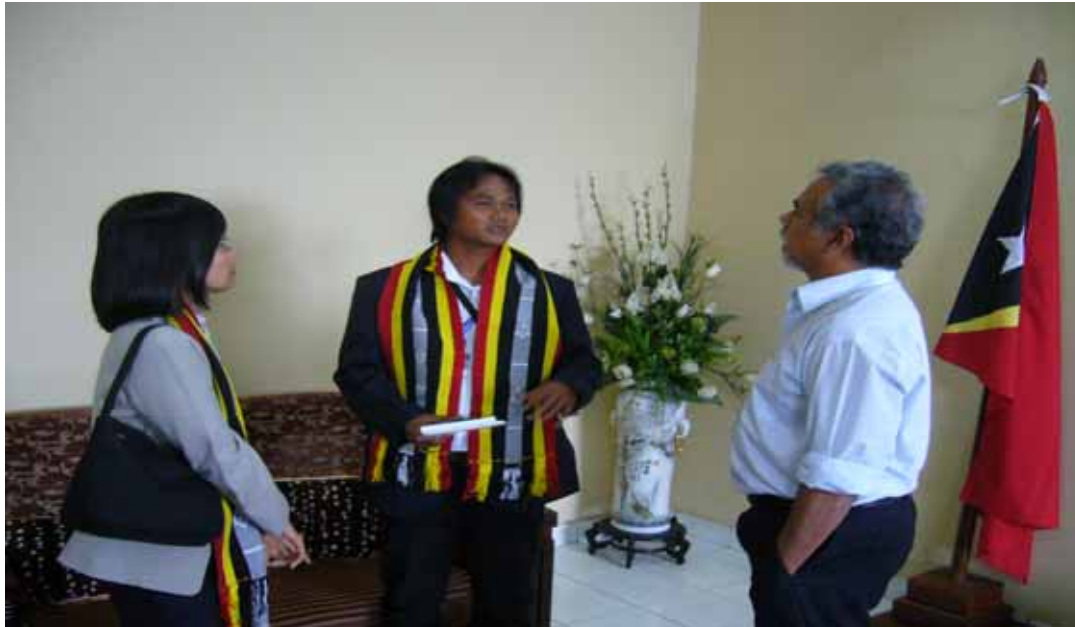
ANFREL observers sharing their findings with H.E President of Timor Leste

government and public facilities. The conflict spread to the grassroots in no time and crystallized as an ethnic issue between the East Timorese in West and East (Lorosae versus Loromono). Hatred and attacks have developed between them, and moreover the civilian harmony has been broken and is worsening because of conflict among gangsters.. The city was under a crackdown until President of RDTL called in international troops to handle security and declared a emergency laws to control the situation.