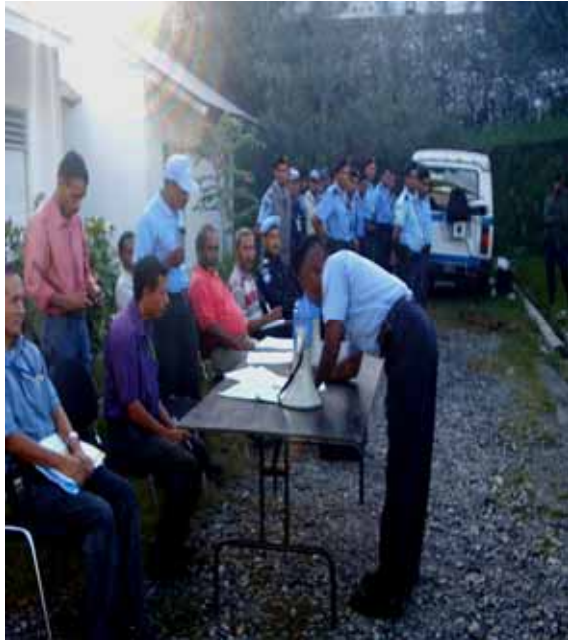
The handover of logistics ceremony in Manufahi