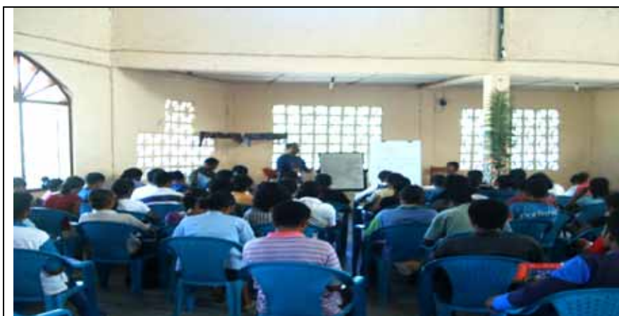
Training inside “the Salele” church facilitated by young priest