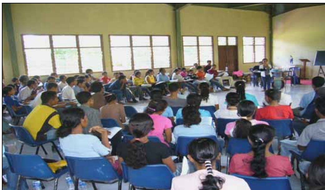
KOMEG Training in Los Palos-Lautern