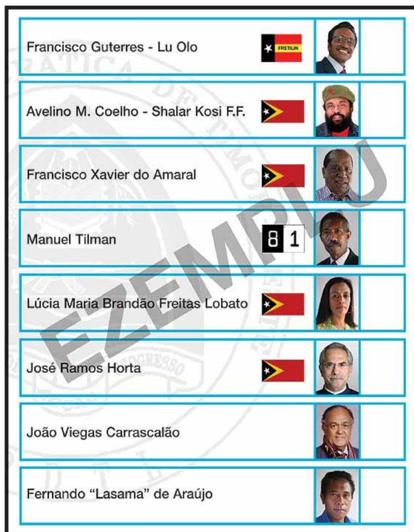
Ballot paper of the Presidential Election 2007