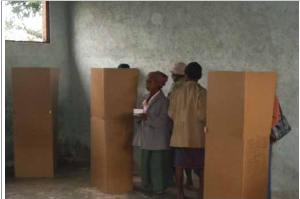
A crowd and confusion inside the voting screen (booths)

Visiting a different polling station, ANFREL found the polling station was set up in different manner, with a different voting procedure; it seemed there was not a standard. Some polling stations placed the Fiscals in the corners, and some others placed them in the middle and another polling station just let them walk freely around in the middle of process. Some polling staff requested and recorded their ID cards but some polling stations did not. It was an interesting situation but generally everything was under control and the opening process continued peacefully.