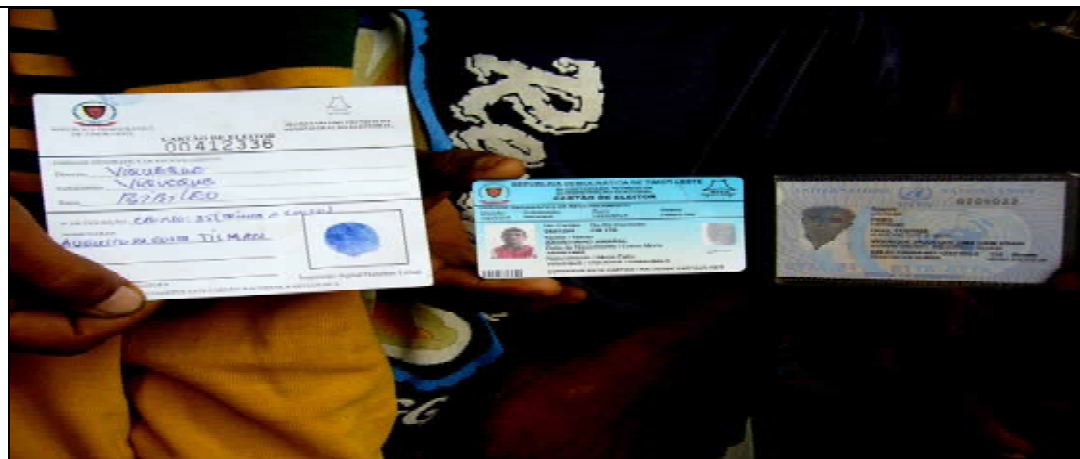
From Left: old Electoral card, new ones. The national ID-card issuing by UN (right) can not be used for election.

The UN identity card could not be used for this election.