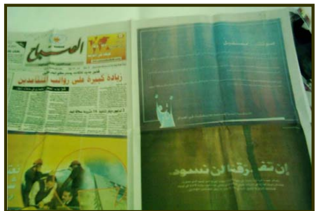
Elections poster in newspapers

Leaflets covering the registration process have been distributed with registration forms. The TV station Al-Iraqiya has begun airing an advertising campaign entitled "Your vote, your future". Training for the media on election reporting is being provided by the Iraqi Media Commission, and by UN and US agencies. Posters promoting the national elections are displayed in public places, and advertisements have been placed in newspapers and magazines. The campaign's impact over the next six weeks will be critical for increasing voter awareness, and to ensure that candidates understand the elections process as well.