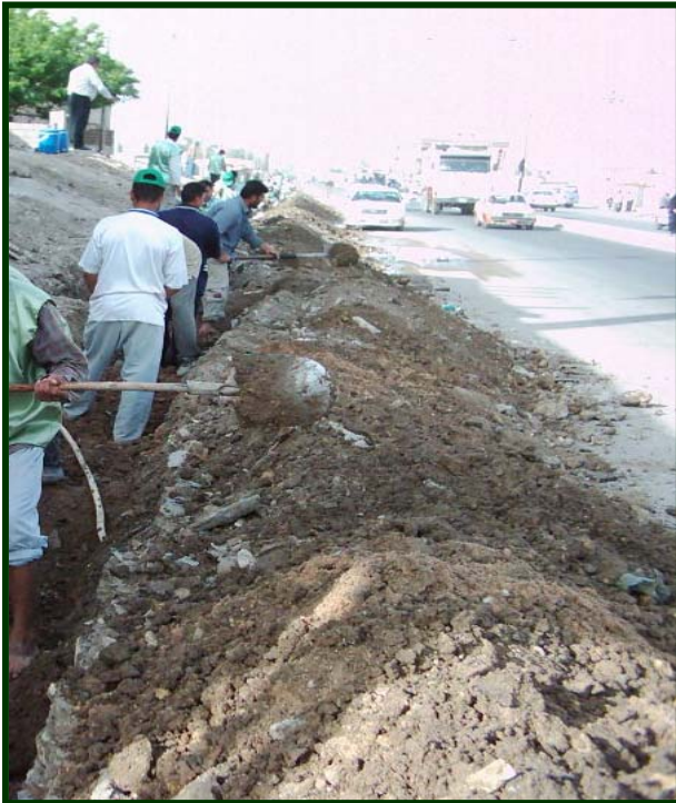
SIESP Project: Iraqi workers laying water mains in Basra