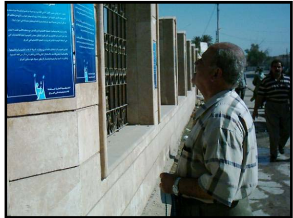
Member of the public reading the democracy posters